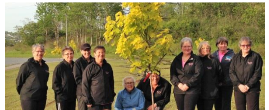
Breasts Ahoy Dragon Boat Ladies - Celebrate Life tree