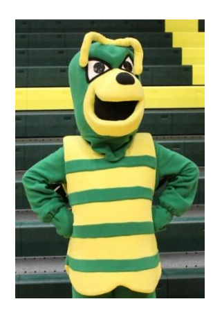
Seabees Supporting Seabees

If covid restrictions are reduced or eliminated, we are optimistic that we will again be able to hold our fall alumni Countdown to Christmas Sale at the school on November 6, 2021. We will not be certain of our booking until late September. We will probably not be certain until September. If we are able to have our sale, we will be looking for vendors of all kinds. Please stay tuned to Simonds High School Alumni on social media for details.