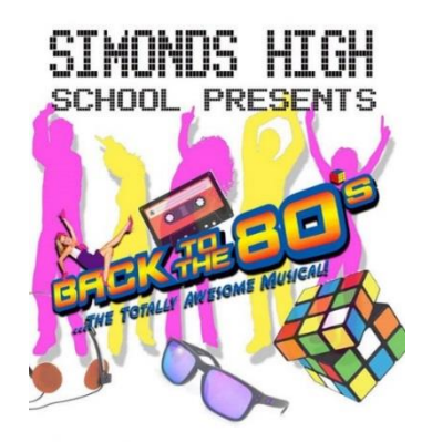
April 24, 25, 26 7pm and April 28 7pm 29 2pm Tickets $10 at Simonds High

Back to the 80's Musical was a huge success!! 5 days of singing, dancing and entertaining was what you got if you were able to check out this show! Simonds students blew audiences away with this production! Congrats to all the students involved!