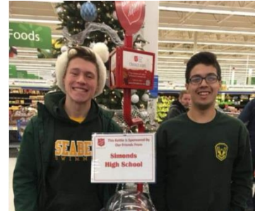
Awesome job SEABEES. Lots of students helping along side the saint john Riptide players! WTG