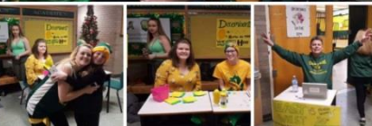
Teens Against Drinking and Driving were at the Riptide game tonight spreading awareness against the dangers of drinking and driving. The students donated Christmas jammies to families in need. The Seabee was a huge hit with the children at the game. AWESOME JOB SEABEES!

Do you remember the decade that brought you the Rubik's cube and Teenage Mutant Ninja Turtles? ...the era of movies such as Ferris Beuller's Day Off, The Wedding Singer, The Karate Kid and Back to the Future? Then, you will enjoy the upcoming spring musical at Simonds. Students are now preparing for their performance of Back to the '80s: The Totally Awesome Musical. This musical is filled with songs from that decade that we all know and love. Do you still remember the tune and lyrics to Wake Me Up Before You Go Go, Footloose, Love Shack, The Man in the Mirror, Walking on Sunshine, Material Girl, Total Eclipse of the Heart or Eye of the Tiger? If you do, plan to join us in the spring so you can sing or hum along to these great songs. More details will be available in our March alumni newsletter.