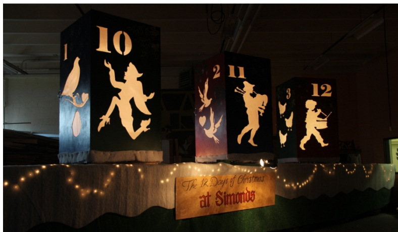
Christmas Cabaret 1995

The Christmas float has been a wonderful gift that Simonds has shared with the Saint John community. Seabees from all years feel the school pride each year when the Simonds float passes by. It is nice to remember the traditions of the Simonds family. At this time of year, may your own family traditions bring you much fun and togetherness and warm your heart! Merry Christmas one and all from the Simonds Alumni Committee!