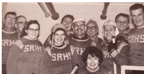
Teacher's Hockey Team