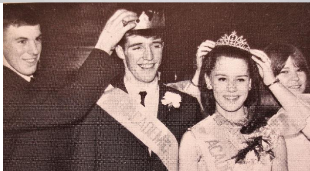
Academic King & Queen