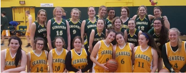
Current SHS team in gold and alumni in green uniforms