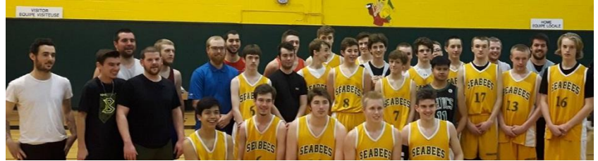
Current SHS team in gold and alumni in street clothes