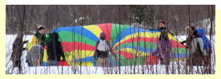
Snowshoeing and parachuting with Team Green & Parks NB

It has been almost one year since the Simonds Pond was created and the 5-yr partnership with Ducks Unlimited began. The creation of a wetland centre of excellence on the school property is an exciting venture! Since then, many interesting things have been underway. One highlight of the past few months has been the celebration of World Wetland Day in February. A day filled with 6 sessions was planned; these corresponded to the school class periods so classes and their teachers could be involved. The community, including the Simonds alumni, were also invited. The majority of activities were offered in both French and English. The sessions / activities were wood carving, connecting with nature, NB Parks and environmental ethics, tracks and scats and 2 sessions on the winter adaptations of animals. Some of the sessions involved snowshoes which were supplied. For special assistance with this day, a sincere thank you is extended to Leo Sheehy (retired Phys ed teacher), Roland Chiasson (Aster Group), Ian Smith (Parks NB), Amanda Didychuk (Nature NB), Danielle Smith (UNB Sustainability) and Nadine Ives (Conservation Council of NB). Simonds teacher, Michele Banks, and Team Green, the environmental group from Simonds are to be commended on this initiative. As this project grows, it hoped that more members of the alumni will join in the special events and take advantage of the walking trails, once they are completed.