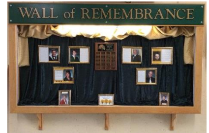
The beginnings of our Wall of Remembrance, a work in progress