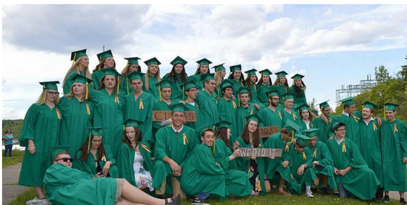
Some Friends from the Class of 2017