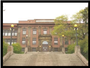
HVHS – Monday, Feb 6 th

Lorne middle school grade 8 students are encouraged to participate in the following High School Open houses. It's a great way to see what each High School has to offer. All open houses start at 6:30pm