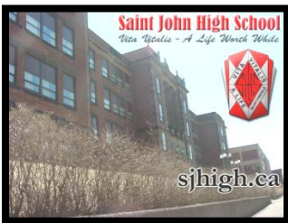
SJHS – Wednesday, Feb 8 th