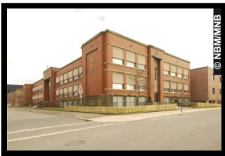
St. Malachys, Tuesday, Feb 7 th