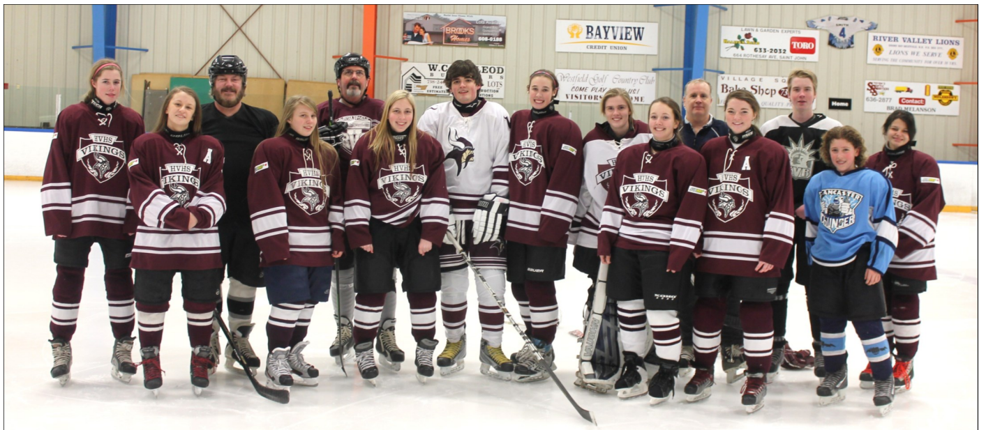
The HVHS girls' hockey team played a special game against their fathers on February 25th.