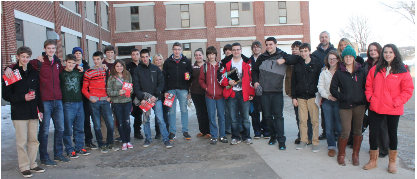
Students attended the Big Data Congress held at the Trade and Convention Centre on February 25.