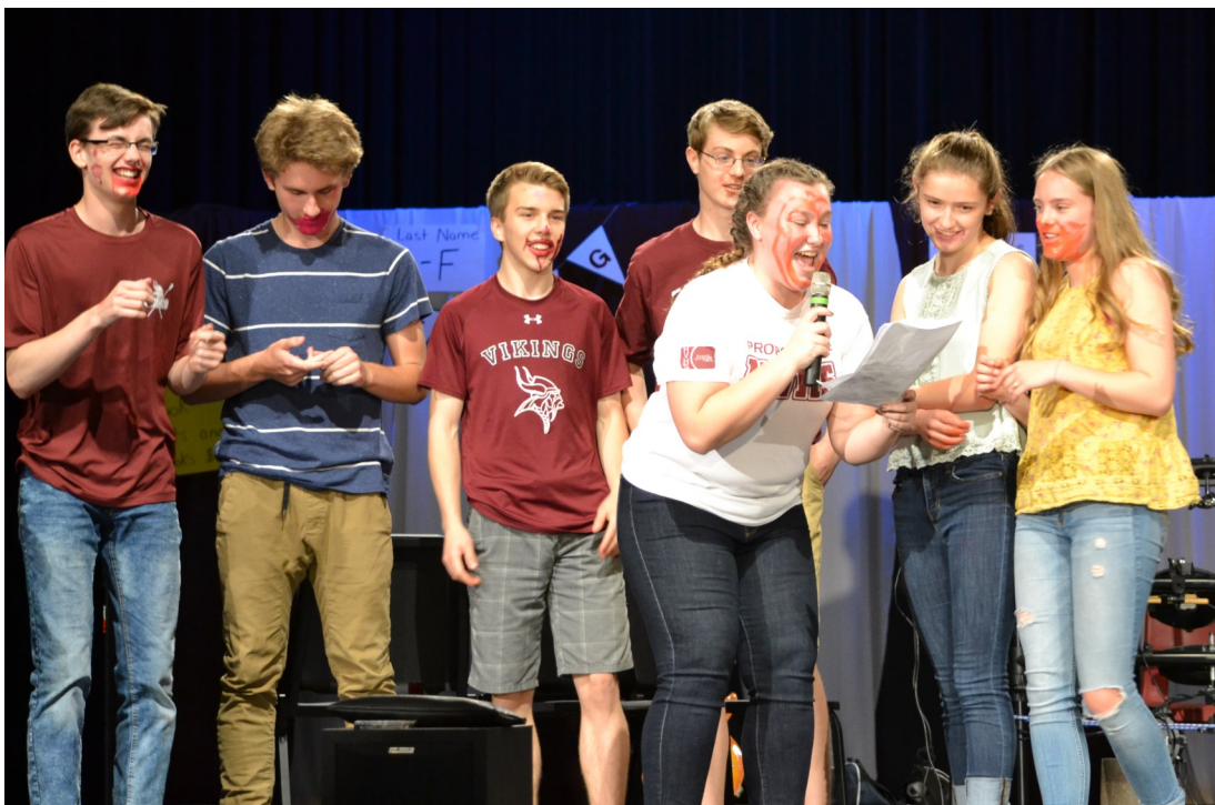
Your incoming SRC had an orientation of their own, including serenading the audience.