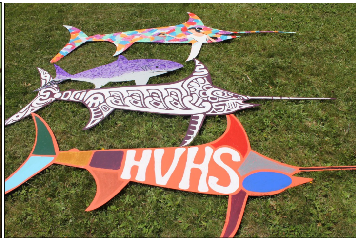
Anglophone South School District hand-painted over 250 fish that will hang from the rafters in the City Market until late 2013, after which time they will be auctioned off to support the Harbour Lights Campaign. HVHS has four fish on display - these were painted by Kylie Fox, Katie Shave & Kerrie Doucette.