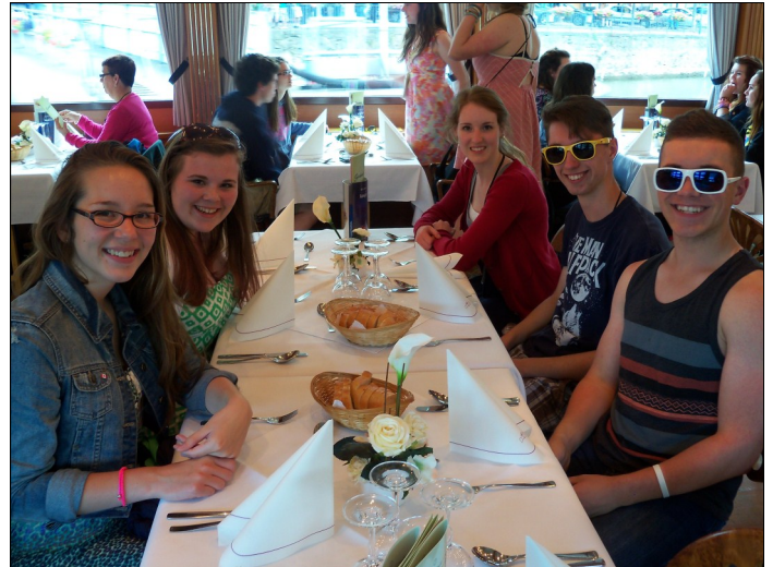
Above left: Students perform at Vimy Ridge in France.