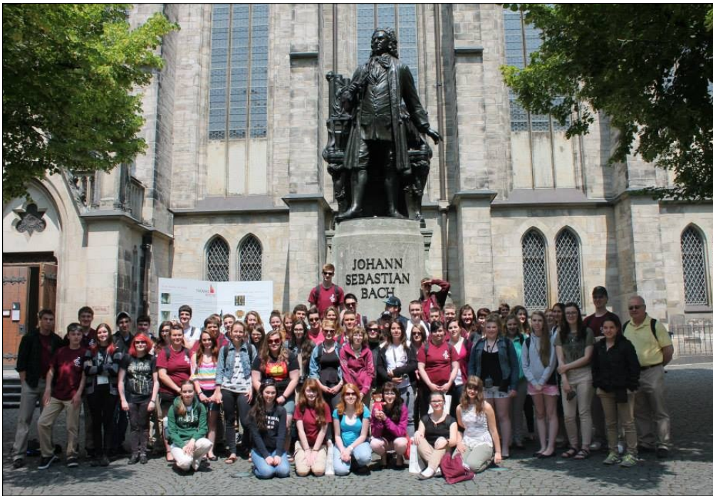
Left: Students gather in front of Bach's statue in Leipzig, Germany.