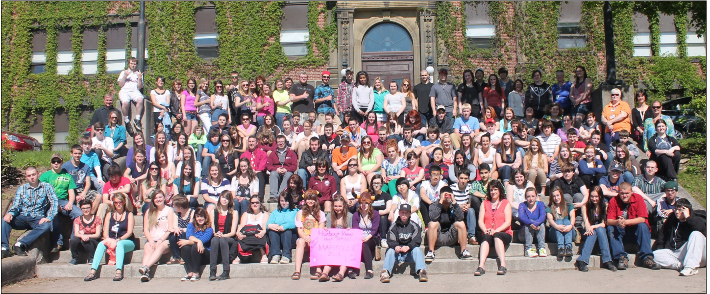
On June 6th, students helped the Marigolds on Main initiative break the Guinness World Record for the most people simultaneously planting flowers.