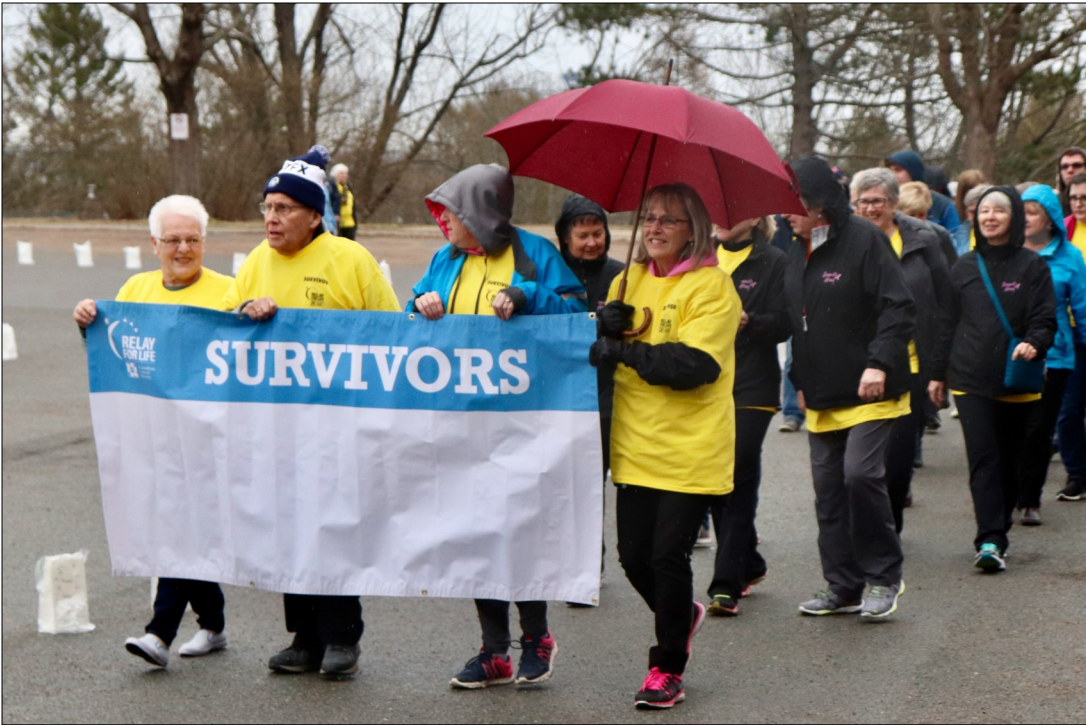
(left) Relay kicks off with a survivor lap. Family and friends of Harbour View walk a victory lap first and then are joined by the rest of the Relay participants.