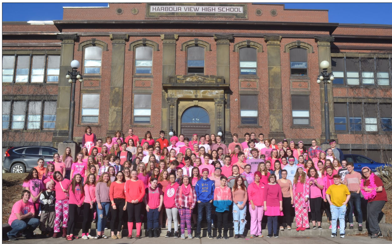
Students and staff mark Anti-Bullying Day on February 28, 2018