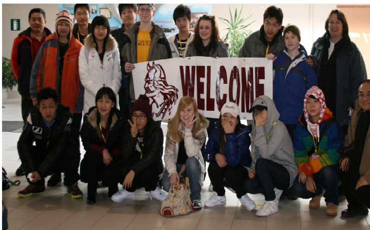
Exchange students are met by Harbour View High students and staff at the Saint John airport in early February.

Another experience that's proving to be unusual for them is the fact that Canadians live in houses. Not one of the ten students here lives in a house back home; they all live in apartments.