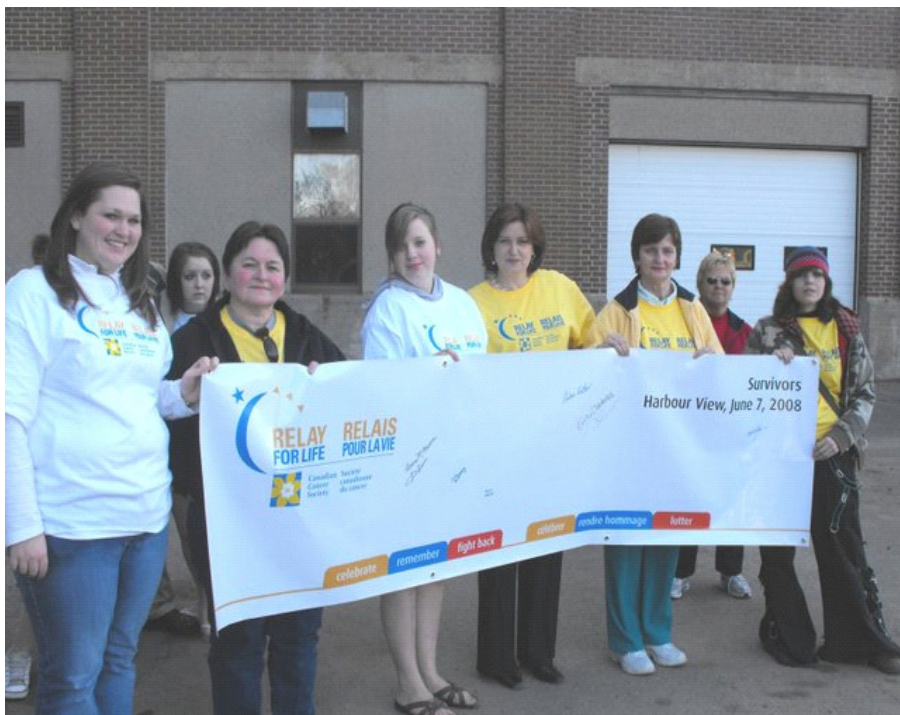
Harbour View High School's contribution to the 2008 Relay of Life.

Sign up book is available in the library.