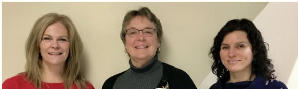
Saint John Public Health healthy Learners in School Program

TALKING WITH YOUR TEEN ABOUT VAPING A TIP SHEET FOR PARENTS