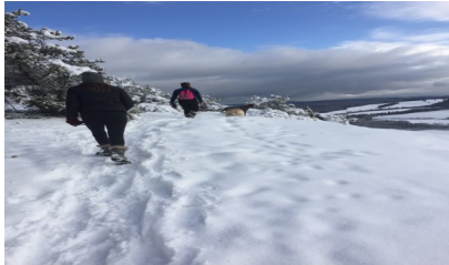
Hike NB trails link

Spending time together is good for everyone. When playing outside remember to stay safe. Use this link for winter safety tips. Keep hydrated with water and wear sunscreen. Look here for more great winter sun safety advice