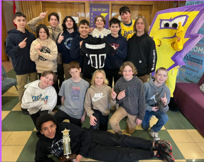
Newcombball Tournament Winners: The Enchanted Leprechauns

The Dodge Hunger Campaign was a huge success bringing in over $500 in addition to 6 boxes of food items for the West Side Food Bank. We are so proud of our students desire to give back to the community.