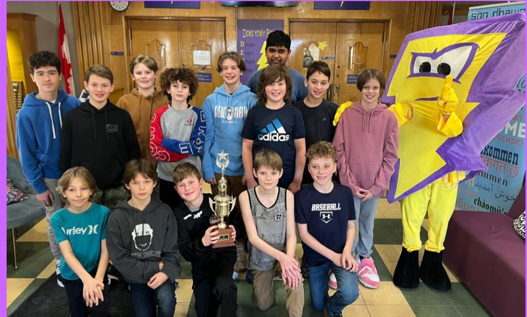
Sportsmanship Award: The Bully Busters