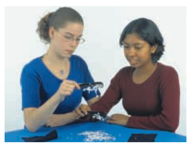
Figure 15.1 Combing your hair with a plastic comb results in an electrostatic charge on the comb

When you comb your hair with a plastic comb, the comb becomes electrically charged and will attract bits of paper. If your comb is made of metal, however, the bits of paper are unaffected by the comb when it is held close to them. Why do metal combs not become charged?