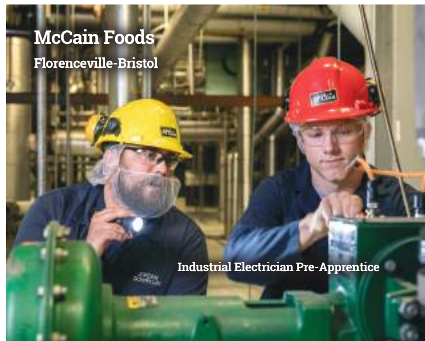
McCain Foods Florenceville-Bristol