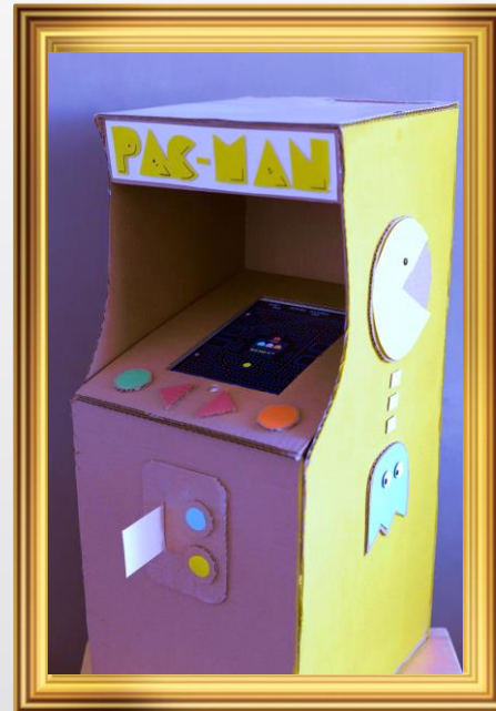
Science Option 2