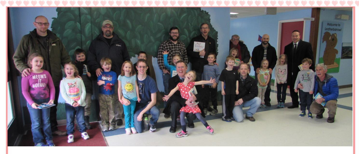
Many of our male guest readers in celebration of Family Literacy Week—Thank you all for coming!