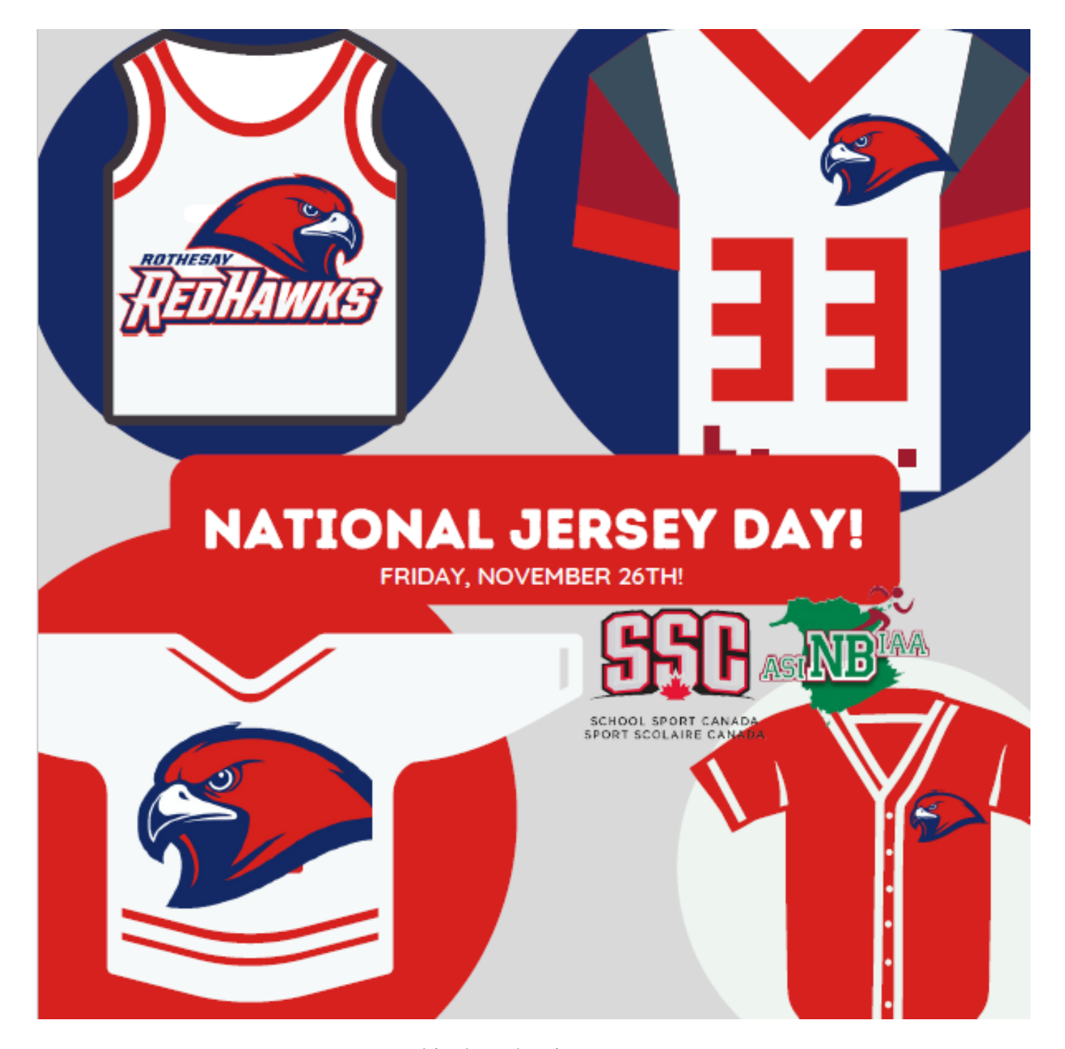
Friday is National Jersey Day!

On Friday, November 26th, School Sport Canada is supporting a national day to show your love and support for sport by wearing a sports jersey to school, work, or play.