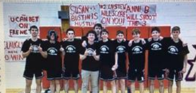
The 2021-22 Kirlman Res

inglements in head about on starts fight. (1). This world remain stocked population includes