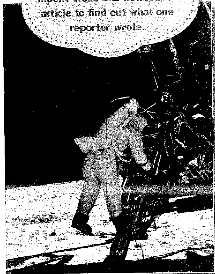
Neil Armstrong steps onto the moon.

What was it like when the first astronauts walked on the moon? Read this newspaper article to find out what one reporter wrote.