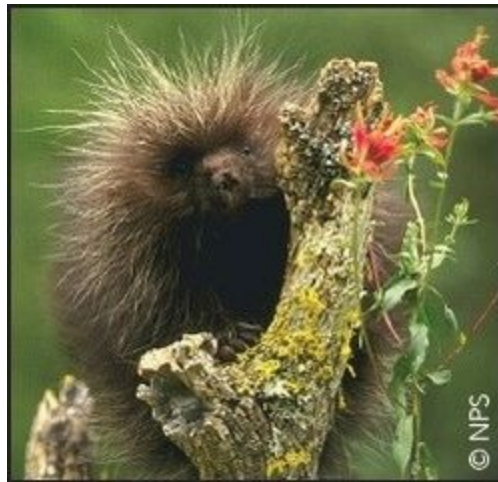
Porcupines have long sharp spines that protect them.

Some toads and snakes have their own way to discourage predators. They puff themselves up to look larger. The bigger an animal, the harder it is to catch and eat. Pufferfish combine both of these adaptations. They puff up AND they have long, sharp spines.