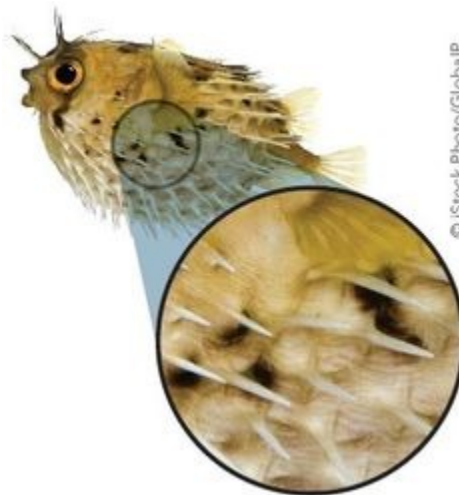
A pufferfish's skin is hard and covered with sharp spines.

Some toads and snakes have their own way to discourage predators. They puff themselves up to look larger. The bigger an animal, the harder it is to catch and eat. Pufferfish combine both of these adaptations. They puff up AND they have long, sharp spines.